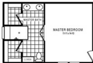
OPTIONAL MASTER BATH LAYOUT

Our home building facilities invest in continuous product and process improvements. Plans, dimensions, features, materials, specifications and availability are subject to change without notice or obligation. Renderings and floor plans are representative likenesses of our homes and may differ from the actual homes. We invite you to tour a Home Center near you and inspect the highest value in quality housing available or call (910) 755-3344 to speak with a Home Consultant. Copyright 2017, CMH. All rights reserved.