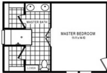
OPTIONAL MASTER BATH LAYOUT

Our home building facilities invest in continuous product and process improvements. Plans, dimensions, features, materials, specifications and availability are subject to change without notice or obligation. Renderings and floor plans are representative likenesses of our homes and may differ from the actual homes. We invite you to tour a Home Center near you and inspect the highest value in quality housing available or call (910) 755-3344 to speak with a Home Consultant. Copyright 2017, CMH. All rights reserved.